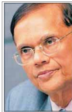
Prof. G.L. Peiris

appreciates the contribution made by the international community and other organizations in various development initiatives. According to the report given to diplomats, compiled by the Presidential Task Force for Resettlement, Development, and Security in the Northern Province, 420,888 people have been resettled in the area, since the end of conflict. No welfare centres in other districts remain other than two in Manic farm. The remaining IDPs in Manic farm too are