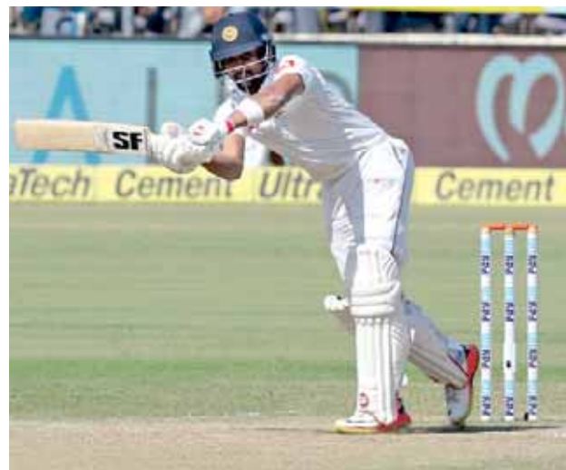
Sri Lanka skipper Dinesh Chandimal played a lone hand to score his second half-century of the Test but it was not enough to save his side from their heaviest defeat.

(DailyNews.lk) - Sri Lanka's nightmares with their batting persisted as they put up another feeble display on a pitch that hardly was of assistance to the bowlers to be shot out for 166 to lose the second Test against India inside four days by an innings and 239 runs and suffer their heaviest defeat in history at the Vidarbha CA Stadium in Jamtha here today. The win meant that India not only took a 1-0 lead in the three-match Test series with one to play but also equalled their largest Test win which was against Bangladesh in Dhaka in 2007 by the same margin. The first Test played at Kolkata ended in a draw and the third and