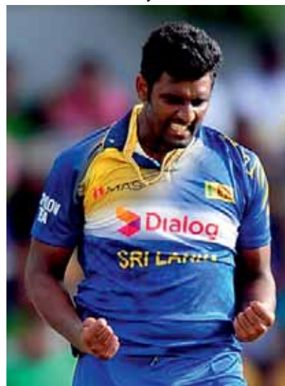
The SLC said that Sri Lankan Cricketer Thisara Perera was appointed to captain the upcoming ODI and T20 matches against India, replacing Upul Tharanga.