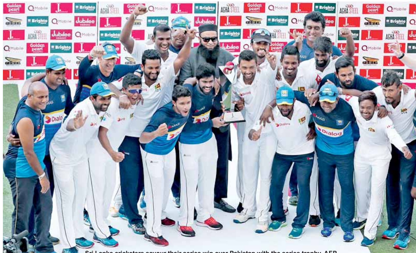
Sri Lanka cricketers savour their series win over Pakistan with the series trophy.

But with the match in the balance going into the final day - Sri Lanka requiring five Pakistani wickets and Pakistan 119 runs with Shafiq and Sarfraz at the wickets the Test was set for an enthralling finish. However batting on a fifth day wicket was always tricky and so it proved as Pakistan were bowled out for 248 with off-spinner Dilruwan Perera taking over the role of destroyer from the great Rangana Herath by finishing with figures of 5 for 98 - his fifth five-for in his career and his second against Pakistan. As in the first innings it was a concerted performance by their bowlers that brought Sri Lanka this memorable win. It was Sri Lanka's first win over Pakistan in an away series since 2000 when they won 2-1 under the captaincy of Sanath Jayasuriya in Pakistan. What a turnaround of fortunes it has been for Sri Lanka on this tour. CONT ON P24