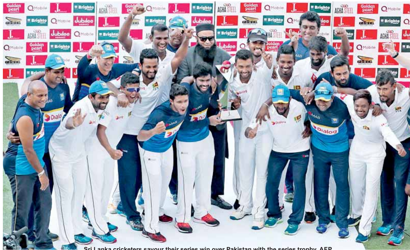
Sri Lanka cricketers savour their series win over Pakistan with the series trophy.