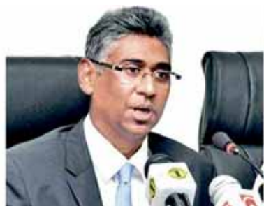
Minister Faiszer Musthapha Amendment to the Constitution. The TNA pledged conditional support