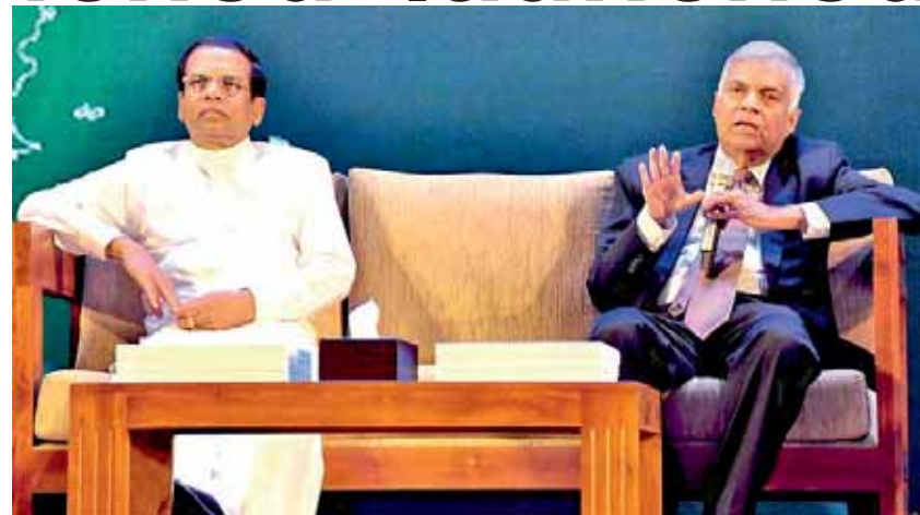
President Maithripala Sirisena and Prime Minister Ranil Wickremesinghe responding to questions from youth representatives during the 'V2025: A Country Enriched' launch have to face the repercussions of that law. This is being felt by politicians now,"... SEE P14

"Today politicians are scared to do wrong because they know that the law can catch up to them. Anyone living in civilised society should have shame and fear. Only animals live without these. When I say fear it does not mean suppression or fear for their lives but they should fear to do wrong because they