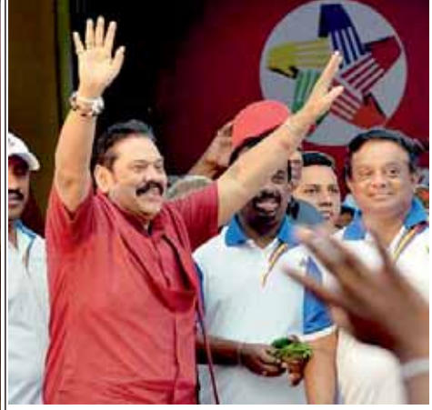
Former President Mahinda Rajapaksa greets his supporters as Joint Opposition members look on at last Friday's rally in Nugegoda.

SEE P10 FOR MORE ON THE JO RALLY. RANIL REPLIES P12