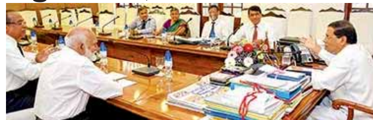
President Maithripala Sirisena addressing members of Ministry of National Integration and Reconciliation