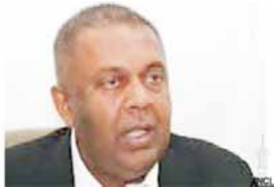
Foreign Minister Mangala Samaraweera

(DailyNews.lk) - Talks between Foreign Minister Mangala Samaraweera and the Global Tamil Forum (GTF) have caused a split among leading Tamil Diaspora