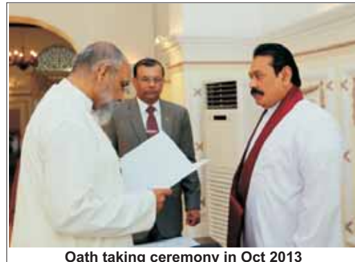
Oath taking ceremony in Oct 2013