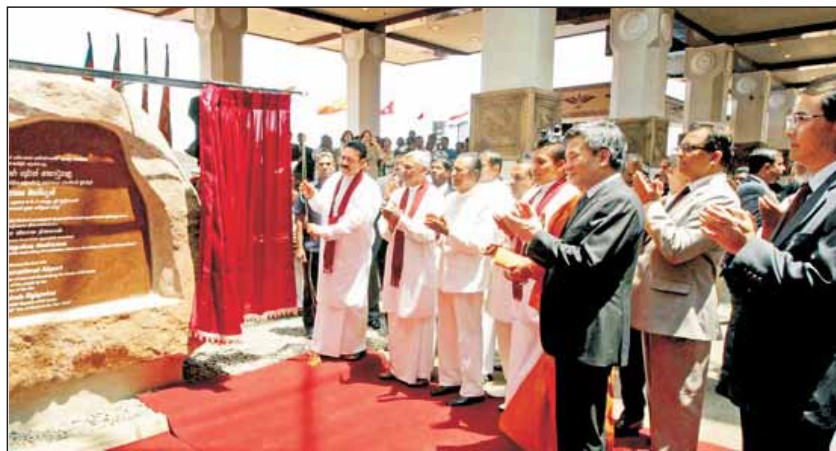
President Mahinda Rajapaksa unveiling the plaque heralding the opening of the Mattala Mahinda Rajapaksa International Airport

Priyankara Jayarathne, Minister of Civil Aviation speaking at the inaugural ceremony said, the opening of Mattala Rajapaksa International Airport would be a new turning point in the Sri Lankan aviation history and this would have a major boost to the economy in South Asia as well as to Sri Lanka in general. The ministry in the meantime has drawn plans to develop the Bandaranaike International Airport under the directions of President Mahinda Rajapaksa and plans were in place to further develop Sri Lanka's tourism industry centralizing the 10 domestic airports across the country.