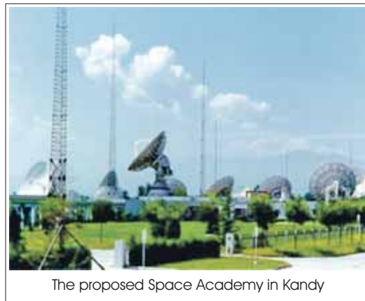
The proposed Space Academy in Kandy

Lanka's first ever Space Academy within the Pallekele BOI Zone in Kandy on Tuesday (14th). Established in 1980, CGWIC is the sole commercial organisation authorised by